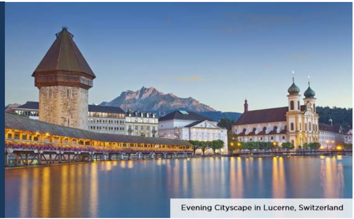
Evening Cityscape in Lucerne, Switzerland

7-night cruise from Amsterdam to Basel July 3-10, 2023 | AmaMora