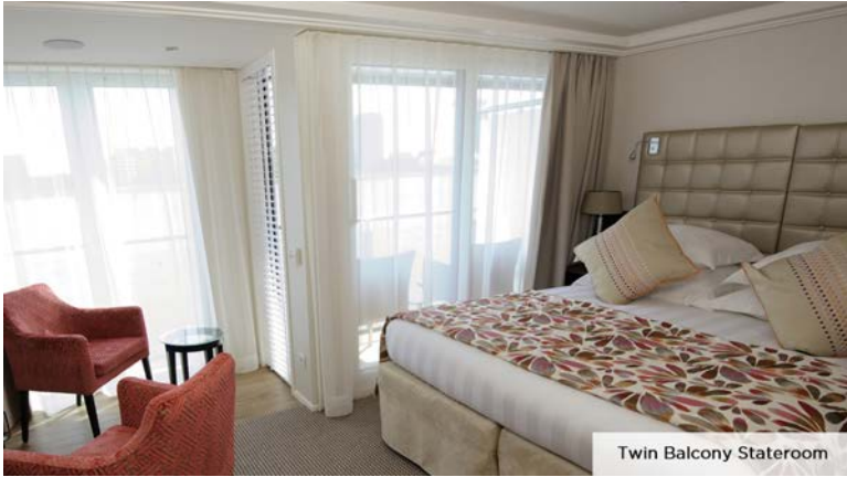
Twin Balcony Stateroom

7-night cruise | July 3-10, 2023 | Aboard AmaMora