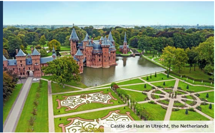
Castle de Haar in Utrecht, the Netherlands

7-night cruise round-trip from Amsterdam November 7-14, 2023 | AmaCerto