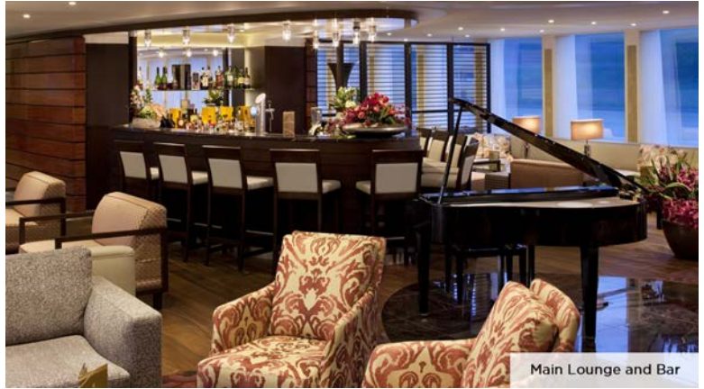
Main Lounge and Bar