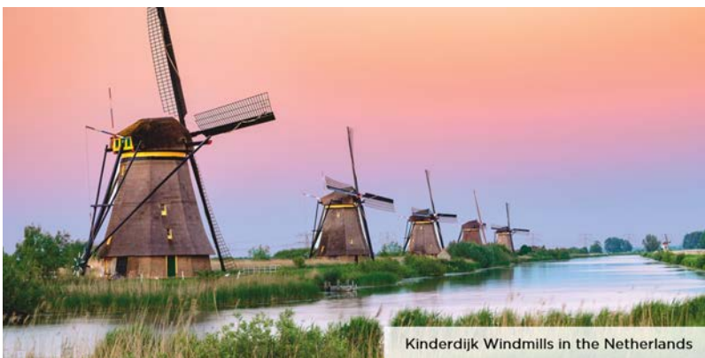
Kinderdijk Windmills in the Netherlands

Book by September 30, 2022 and SAVE $1,250 per person